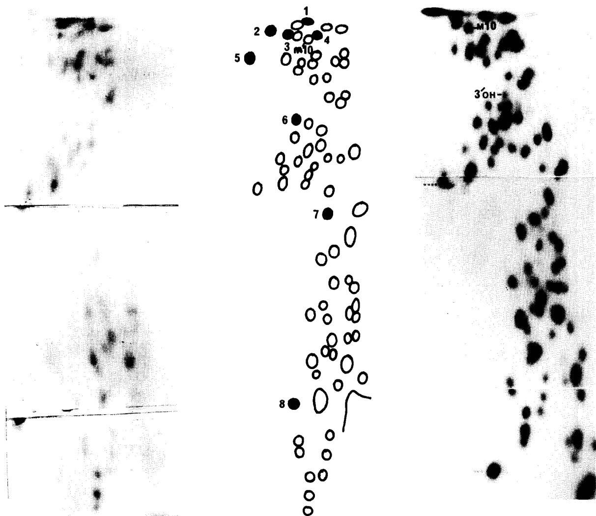
Fig. 2. (A,B). Fingerprint of 25 S pre-rRNA of E. coli AB 105. 25 S pre-rRNA was prepared from ^{32} P-labelled cells and fingerprinted as above. Open and closed spots in fig. 2B have the same significance as in Fig. 1B. (C) Fingerprint of mature 23 S rRNA.

some precursor particles [12] shows clearly that the latter species is considerably shorter than the former containing only four of the eight extra oligonucleotides found in the 17.5 S pre-rRNA.