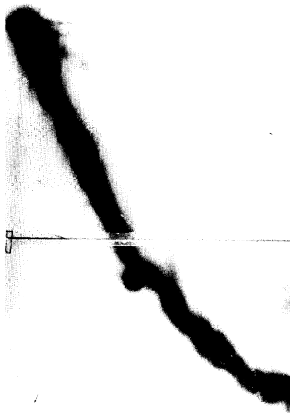
Fig.5. Phosphatase diagonal of a T1 RNase digest of 30 S pre-rRNA. First dimension left to right, second dimension top to bottom. The arrow indicates the 5' terminal oligonucleotide of the RNA.

However preliminary studies of the 17.5 S and 15 S RNAs produced by in vivo cleavage of the 30 S pre-rRNA have shown that alkaline hydrolysis of these RNAs (CM treated cells) releases significant amounts of adenosine and guanosine tetraphosphate (0.1–0.5 mol per mole of 17.5 S and 25 S pre-rRNA, A: \approx 3:2). In contrast similar analyses of the 17.5 S and 25 S products of RNase III treatment of 30 S pre-rRNA in vitro and of residual 30 S material recovered from RNase III digestion mixtures shows that none of them contains a 5' terminal triphosphate residue. The presence of 5' triphosphate residues in the products of in