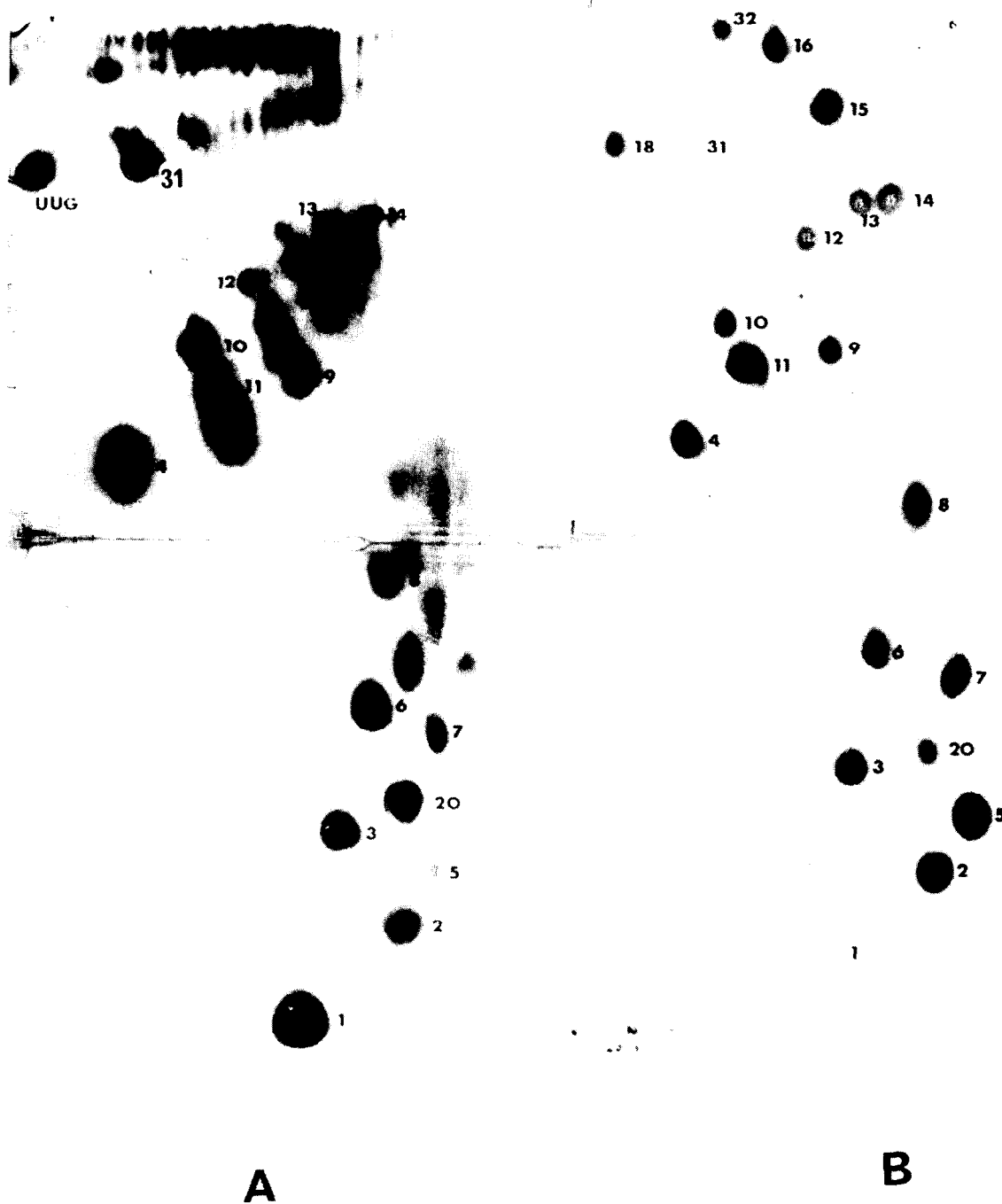
Fig. 3. (A) Fingerprint of a low mol. wt fragment released during RNase III treatment of 30 S pre-rRNA in vitro. (B) Fingerprint of 5 S rRNA of E. coli D10. The RNAs were digested with RNase T1 only.